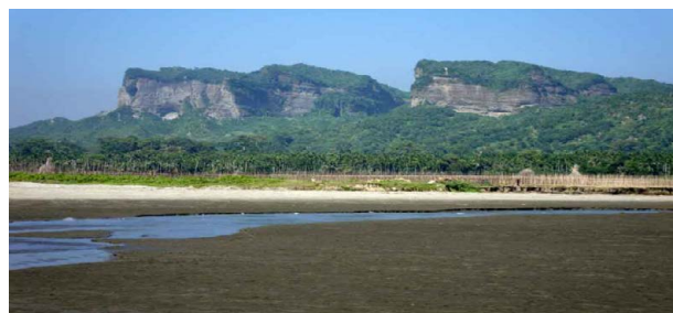
Figure 4: Teknaf the border of Bangladesh.

Due to hundreds of years of neglect our iconic Sundarbans is getting slimmer. As per The Prothom Alo (3 September, 2016) the area