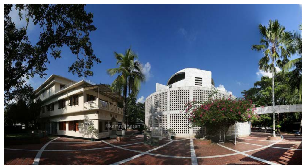
Figure 12: Bangabandhu was buried at Tungipara under heavy security after his assassination at the above mausoleum. (Source: https://www.google.com/search?q=images+of+tungipara&client=firefox-b-ab&tbn=isch&imgil ).