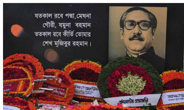
Figure 1: Bangabandhu The architect of Bangladesh and the “Father of the Nation”.

His father’s name was Mr. Sheikh Lutfur Rahman and his mother’s name was Mrs. Saira Begum. He was married to her cousin Begum Fazilatunnesa in 1942.They were blessed with 5 children of which Sheikh Hasina is the eldest of all and is our current Prime Minister – Desh Ratna. In 1939 when Chief “Minister Sher-e-Bangla” A K Fazlul Huq along with Huseyn Shaheed Suhrawardy came to visit his school, Bangabandhu lead a demand to repair the cracked roof in front of theses towering figures. Both iconic leaders were very much impressed with his courage and effectively that was the beginning of his political career. They invited him to move to Calcutta. Later Bangabandhu moved to Calcutta and finished his Bachelor of Arts (BA) from Islamia