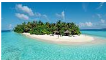
Figure 10: St. Martin’s Island (a coral reef island).

Bengal. Bangabandhu wanted to transform “St. Martins Island” (Figure 10 and 11) as the wonder Island of the World after the Great Barrier Reef of Queensland, Australia. But he did not get the opportunity to use his imagination and vision to develop neither the “Cox’s Bazar Sea Beach” nor the “St. Martin’s Island”. If that tourism icon along with other iconic destinations can be developed through sustainable and ecotourism facilities then the country will have the potential to earn billions of tourist dollars and can become number one source of foreign currency earners. Then the nation does not need to wait until 2041 to attain the developed country status.