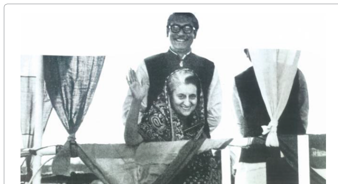
Figure 3: Indira Gandhi the best friend of Bangladesh (a friend in need is a friend in deed).

After becoming the Prime Minister of independent Bangladesh he did not live in the Ganobgaban to save national expenses instead he preferred to live in his own home at Road No- 32, Dhanmondi with minimum security. The defeated Pakistani army became furious to take revenge and they did not leave any stone untouched to kill Bangabandhu. They recruited Traitor Mustaq and his team to kill Bangabandhu. He loved and trusted his countrymen so much that even when Indira Gandhi informed and warned Bangabandhu that his life is in danger, he disregarded that warning by saying that those army officers are like my children they will not do any hard to me. But the traitor Mustaq and the notorious ambitious army officers not only brutally killed him but they killed his he entire family and extended family to make sure that no member of the Sheikh family remains alive