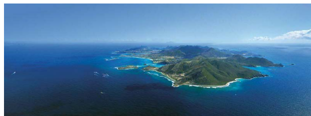
Figure 11: The St. Martins island (The only coral reef in the country) http://www.stmartin island.org/media/rokgallery/a/a3838d9b-8be8-445a-88c6-559c7988c185/960863f4-11df ).

God carries out his justice in a very mysterious way. There is a famous quote in English that “When God closes the doors somehow he opens the window” for the sunshine to seep through. That window of hope is nobody else but it is Bangabandhu’s eldest daughter his own blood - the iron lady of Asia - our honorable Prime Minister – Desh Ratna - Sheikh Hasina. God kept Sheikh Hasina alive to salvage the country from darkness and punish those culprits. The Pakistani favorite governments ruled the country for more than two decades with their oppressive misrules, rampant corruption and they have systematically closed the door to put the killers of Bangabandhu on trial. Rather than punishing the successive governments rewarded, promoted and protected those self-confessed killers. The death of the “Father of Nation” took the country backward for nearly 25 years instead of progress and prosperity.