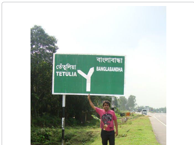
Figure 5: Tetulia northern border of Bangladesh with India (source: https://www.google.com/search?q=images+of+tetulia&client=firefox-b-ab&biw ).