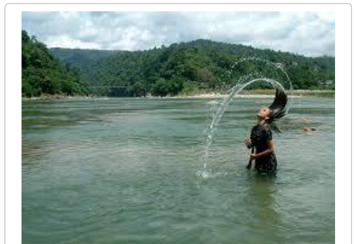
Figure 8: Crystal Clear Dauki River Water and It is time to have a bath. (Source: https://www.google.com.bd/webhp?sourceid=chrome-instant&ion=1&espv=2&ie=UTF-8#q=images+of+Janflong+sylhet ).

1973: He met a lot of world leaders at Algiers Non-Aligned Summit