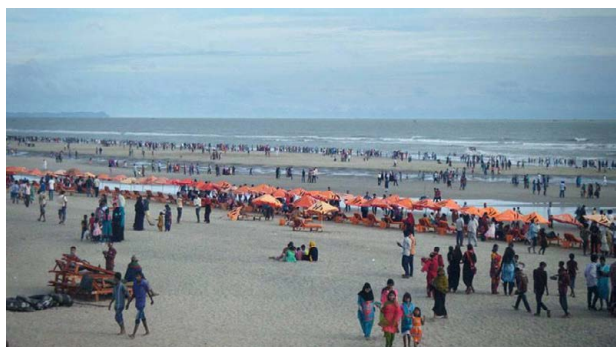
Figure 9: World’s Longest Unbroken Sandy Sea Beach at Cox’s Bazar. (source: https://www.google.com/search?q=images+of+cox%27s+bazar&client=firefox-b-ab&biw=1366&bi ).

It is a piece of paradise which has protruded into the sea at the Bay of