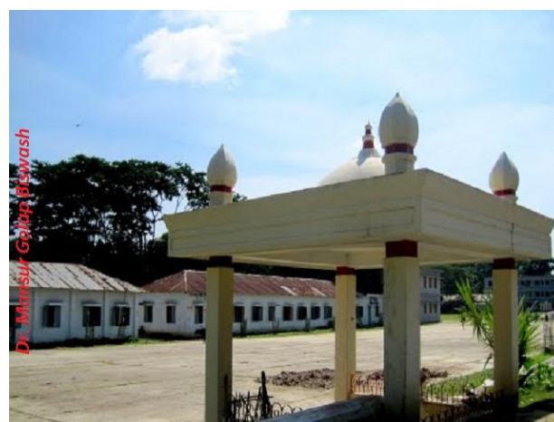
Figure 2: Bangabandhu began schooling at Gimadanga Tungipara High school. (Source: https://www.google.com/search?q=image+of+gimadanga+tungipara+high+school ).